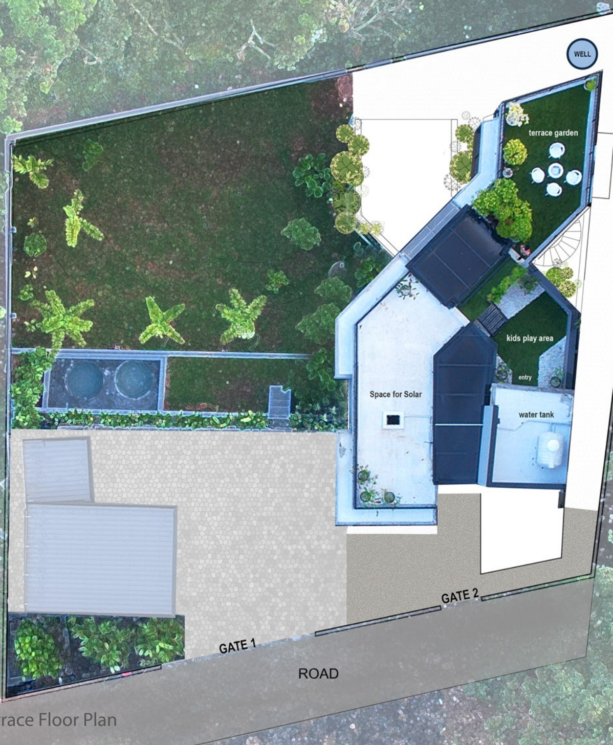
Terrace Floor Plan

Balconies can create a sense of openness and light, and they provide an outdoor space that can be used for entertaining and leisure activities. They also offer different view points, allowing the inmates to experience their environment from different angles.